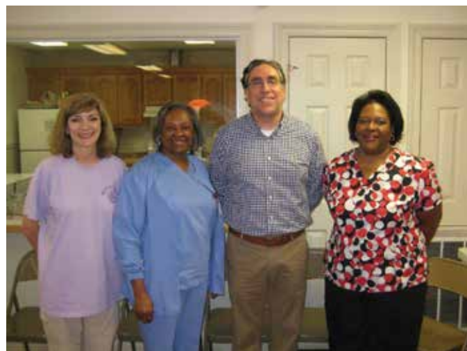
REAP in Collins, MS