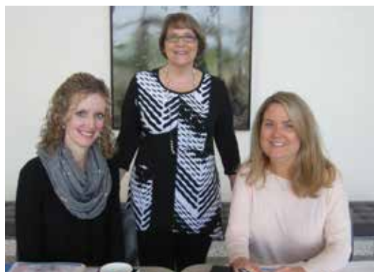
Through the Renal Dietitians of Mississippi, the MKF works closely with the over 50 dietitians that work at the 80 dialysis units in the state.

The MKF has ordered additional “binder reminder” pill boxes that are specifically designed for carry-along in your pocket or purse. Phosphate binders are pills that dialysis patients must take with each meal to help protect them from absorbing too much phosphate from food and drink.