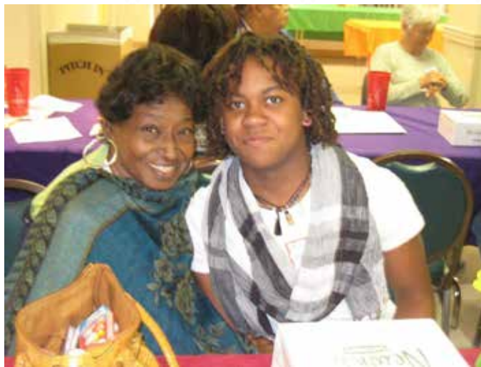
Patient Conference in McComb, MS